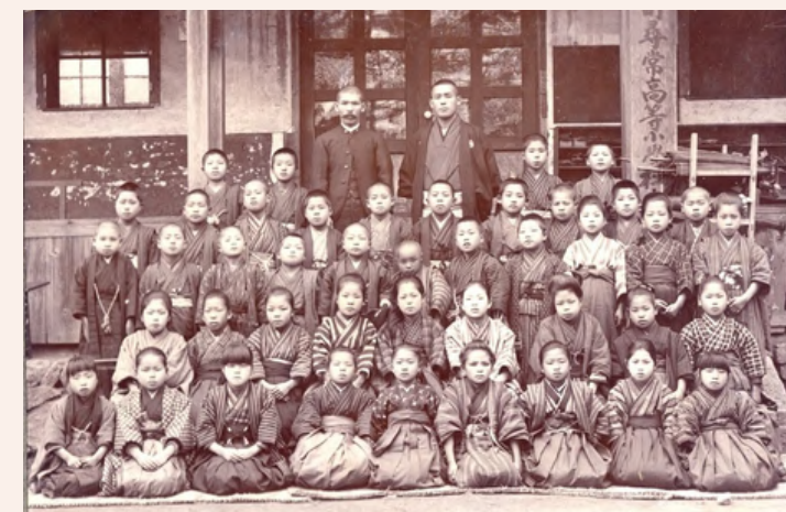
Graduates of the Standard Course, 37th Year of the Meiji Era